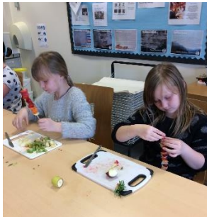
Photographs of activities taking place at Discovery Schools Academy Trust's Easter HAF provision